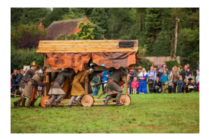
A battering ram being pushed by siege re-enactors.