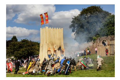
A siege tower being pushed towards a curtain wall during a siege reenactment.